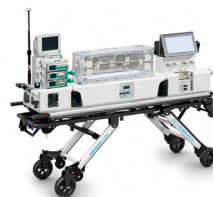
TG-880 C4 IN