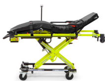
TG-1000 POWER BRAVA